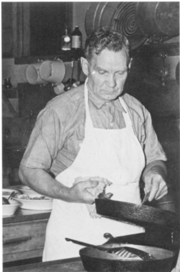
The camp cook of the Meadow River Lumber Company, Rainelle, West Virginia.