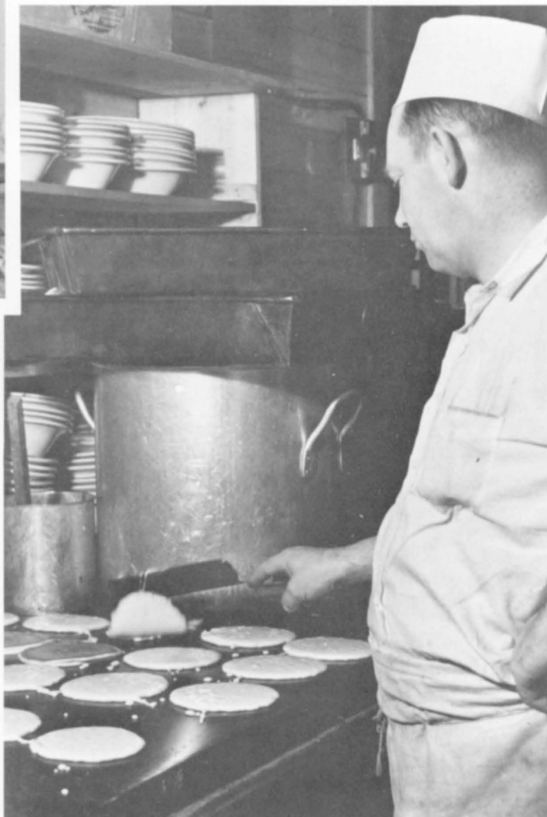
The men and women pictured above worked in cookhouses in Washington and northern California during the 1940s.