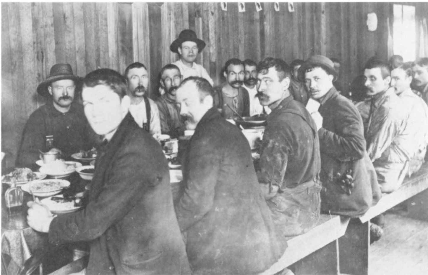
Mustachioed loggers enjoy a hearty breakfast at a camp dining room near Sedro Woolley, Washington, ca. 1900.