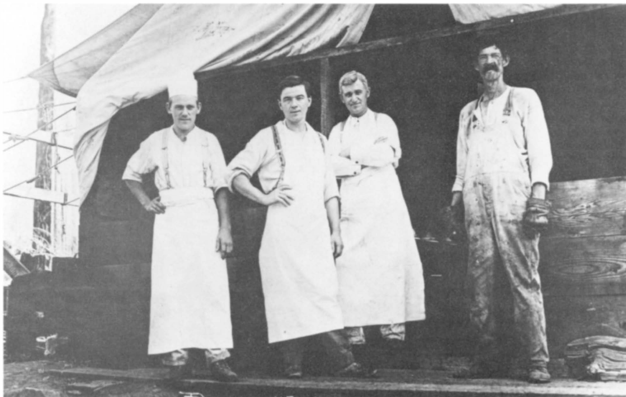
A cookhouse crew of the Silver Falls Lumber Company near Silverton, Oregon. From left: baker or second cook, cook, dishwasher, and bull cook.