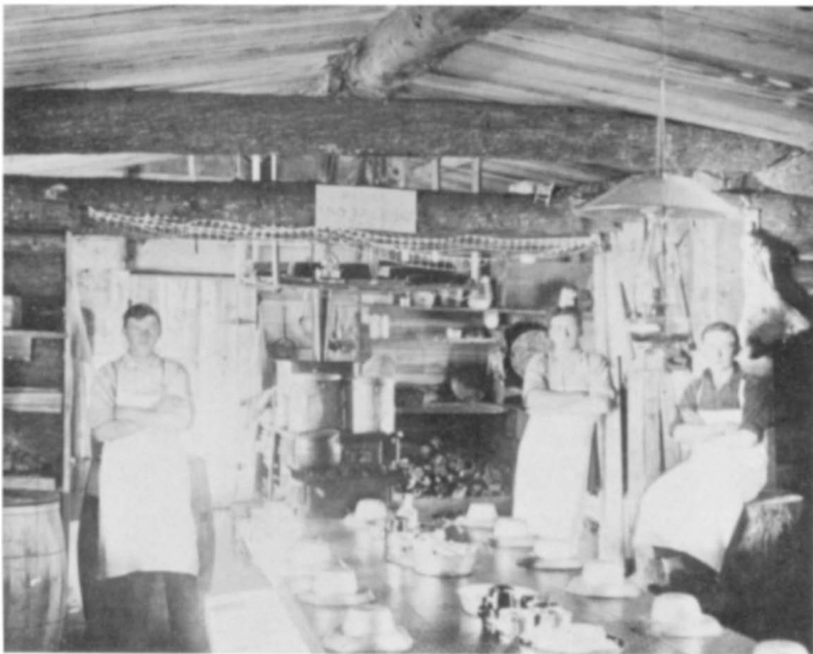
A crudely lettered sign above the stove in this Minnesota cookhouse (1911) reads "Notice: No Talking at Tables."