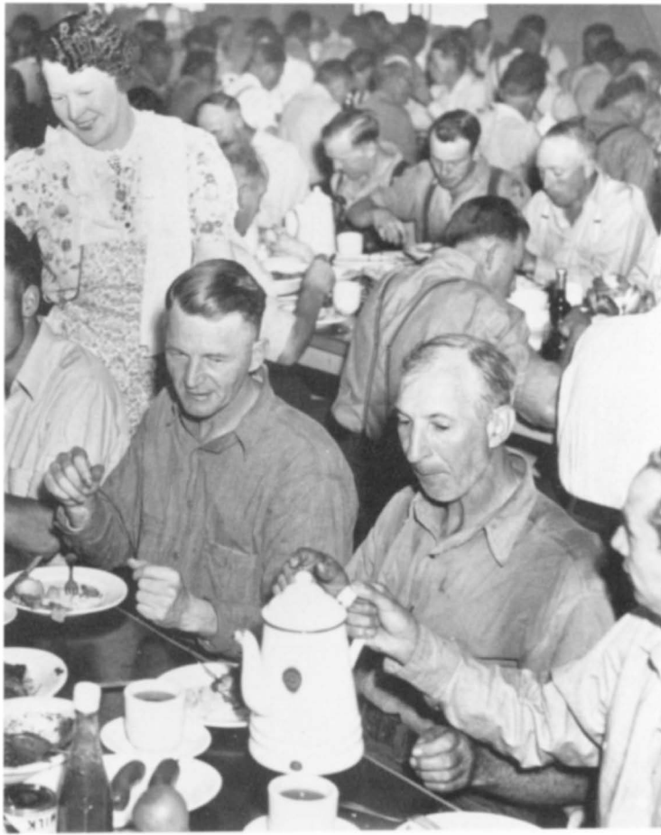
Hungry Weyerhaeuser loggers pitch into a "lovely meal" at a big mess hall in Washington, ca. 1947.